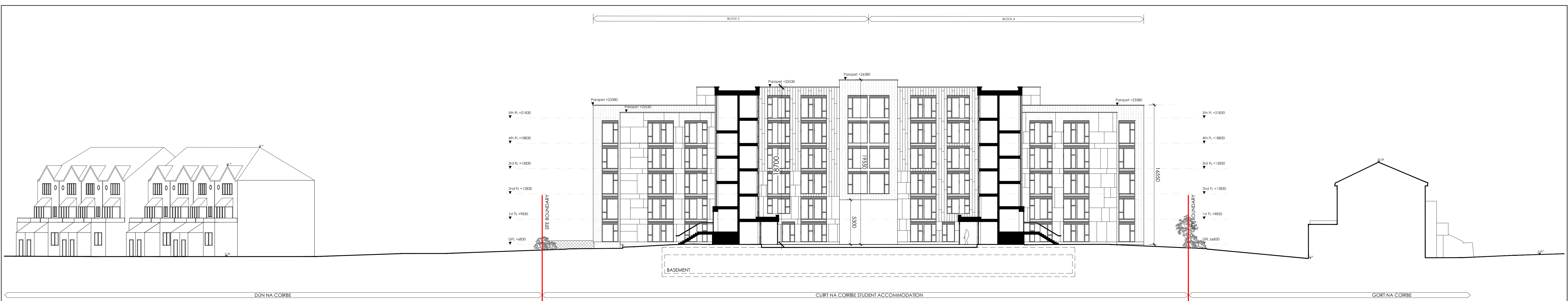
03 Proposed Section 03 400-103 1:200