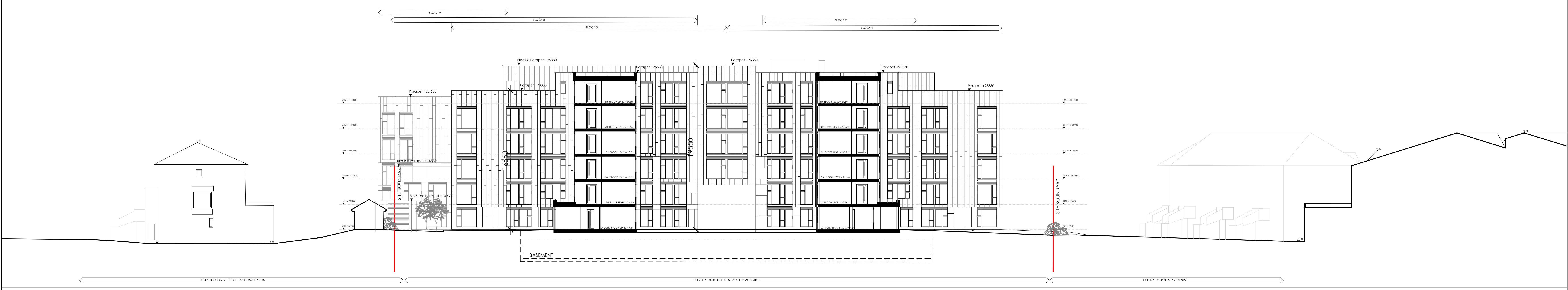
04 Proposed Section 04 400-104 1:200